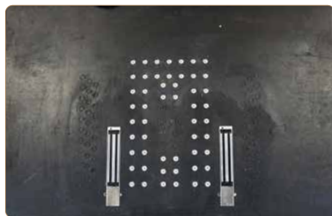
Optional: 2 or 4 magnets in the work surface of the TopGrinder.

The dimensions of the work surface are 1280 x 780 mm (W x D). However, there is no maximum length to workpieces because you can fold down the side panels easily. The front panel you can flip as well making it possible to work on wider products without a problem. Not only the best looking table grinder around, also the safest one.