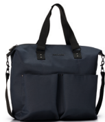
Nursery bag (all colours)