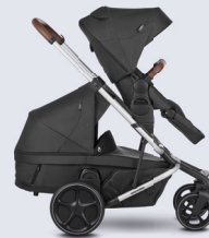
With seat and carrycot (optional extension set)