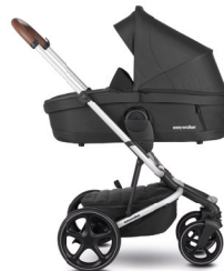
jet black (silver frame)