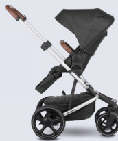
With parent facing and world facing seat