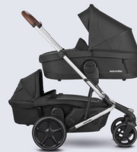
With two carrycots (optional extension set)