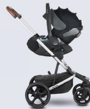
With car seat