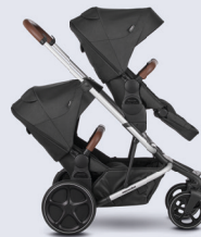
With two seats (optional extension set)