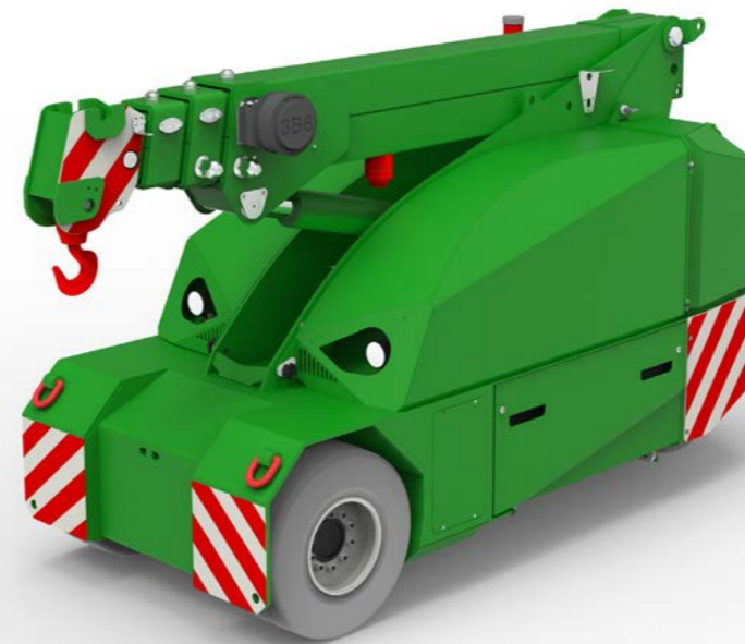
MC 45S (metric) Max Capacity 4,500 Kg