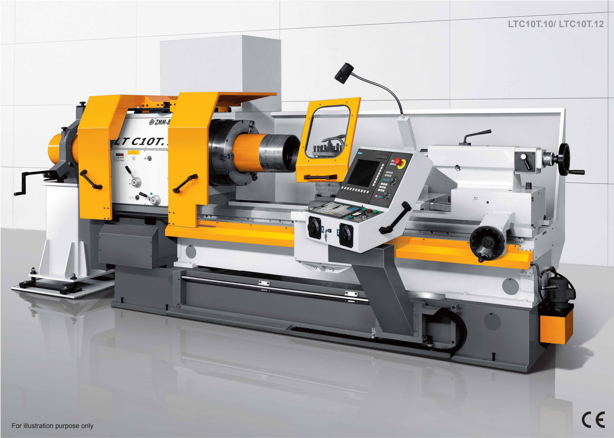
For illustration purpose only